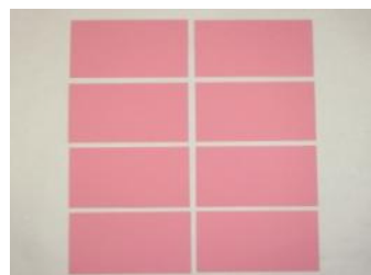
DSP Pattern 1