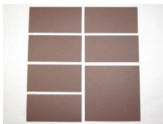
All DSP Pieces