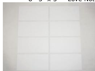
DSP Pattern 2