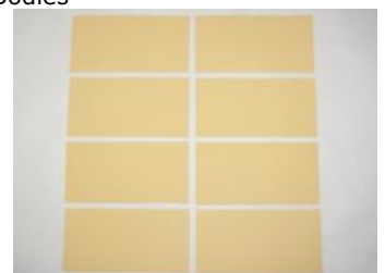
DSP Pattern 3